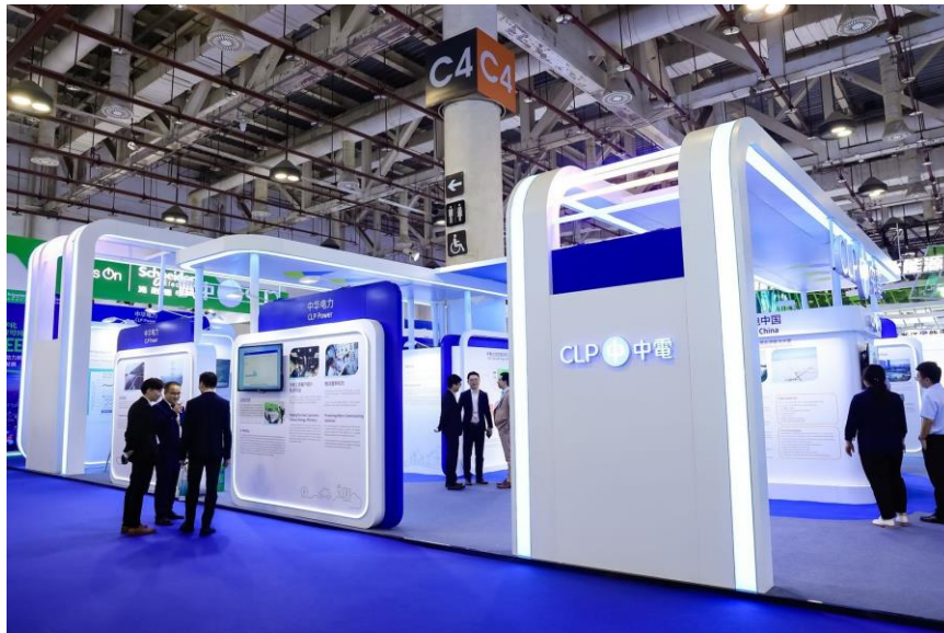
The exhibition staged at CEPSI 2023 presents CLP's Climate Vision 2050 and the business of CLP Power, CLP China, and CLPe.